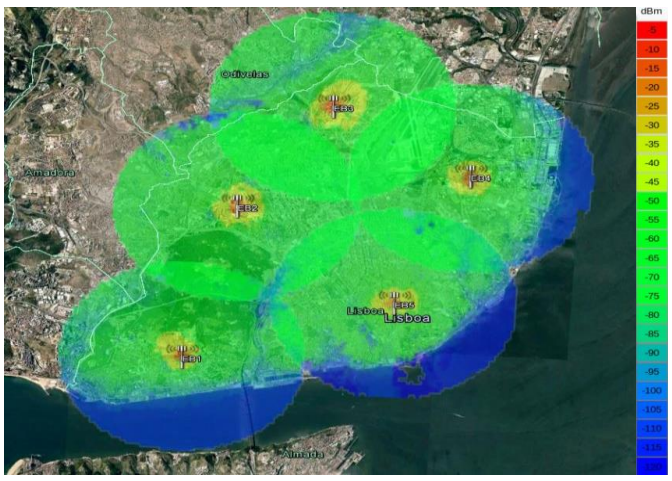
Fig. 3 – Coverage with model Okumura-Hata.

The simulations were made with CloudRF software [5]. Figure 3 shows five BTS used to cover the Lisbon area and the coverage level for each BTS. There is a coverage percentage over 95%. You can see an overpal of some BTS, which is good and purposeful, because SIGFOX uses it to minimize interferences between sensors.